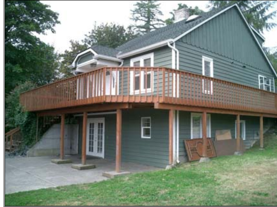
North side earth wood at siding