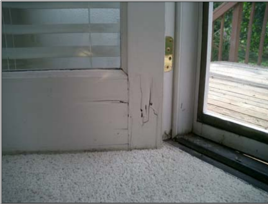
Fungus-rot of door south side