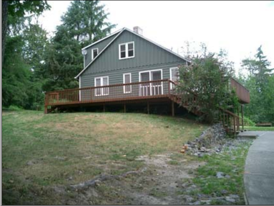
Deck posts earth wood at south side