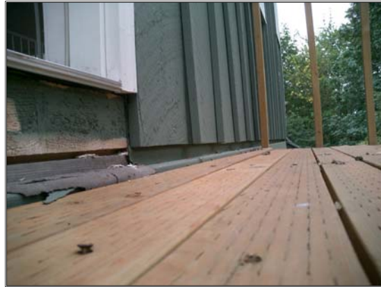
Moisture condition-Flashing needed west side